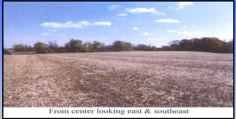
From center looking east & southeast

Potential Development Property Located Just North of Kendall Hills and Kendall Estates Subdivisions