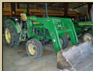
John Deere 5420