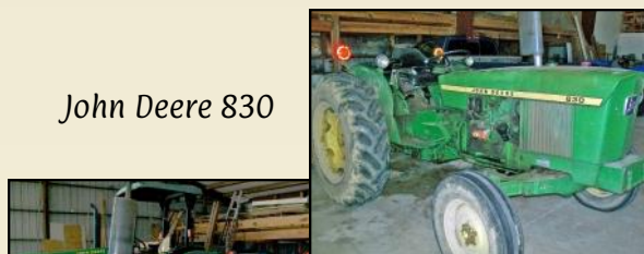
John Deere 830