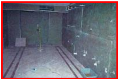
Public Restroom off Atrium Area