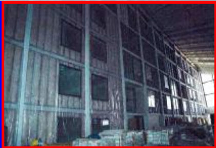
Interior Rooms From Atrium