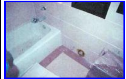
5th Floor Interior Room Bath