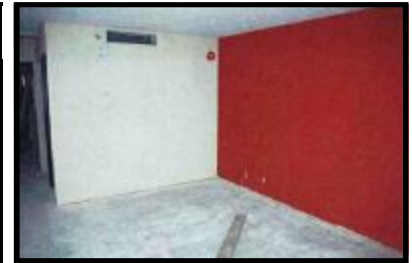
5th Floor Interior Room