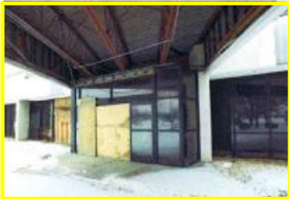
Main Entrance Under Canopy