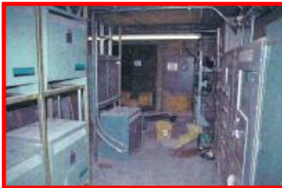
Main Electrical Room