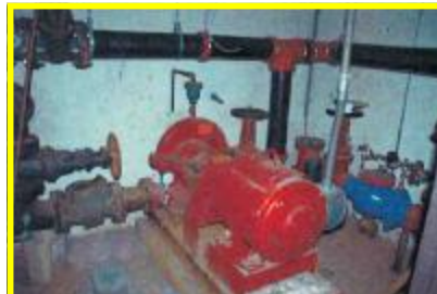
Fire Suppression Equipment