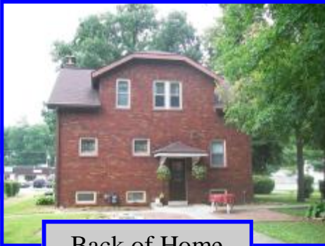
Back of Home