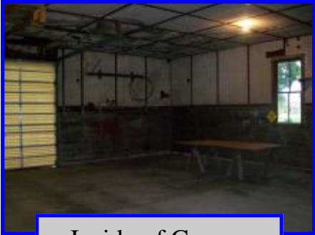
Inside of Garage