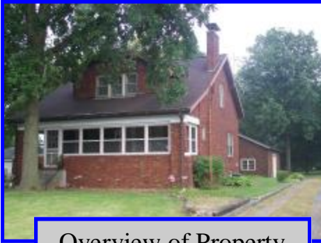
Overview of Property